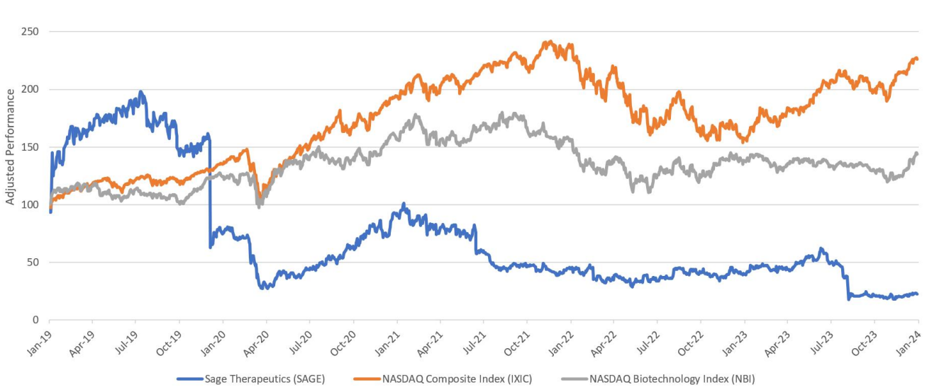
Comparison of Cumulative Total Return* Among Sage Therapeutics, Inc., the Nasdaq Composite Index and the Nasdaq Biotechnology Index

The following graph illustrates a comparison of the total cumulative stockholder return for our common stock since January 1, 2019 through December 31, 2023, to two indices: the Nasdaq Composite Index and the Nasdaq Biotechnology Index. The graph assumes an initial investment of $100 on December 31, 2018 in our common stock, the stocks comprising the Nasdaq Composite Index, and the stocks comprising the Nasdaq Biotechnology Index. Historical stockholder return is not necessarily indicative of the performance to be expected for any future periods.